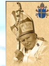
Pope John Paul II

"Man cannot fully find himself except through a sincere gift of himself." Gaudium et Spes